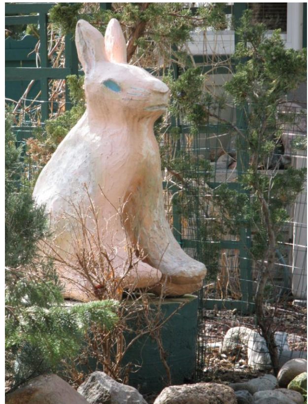
Where Do You Think This Is?